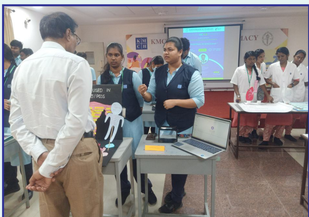
National Science Day Celebration