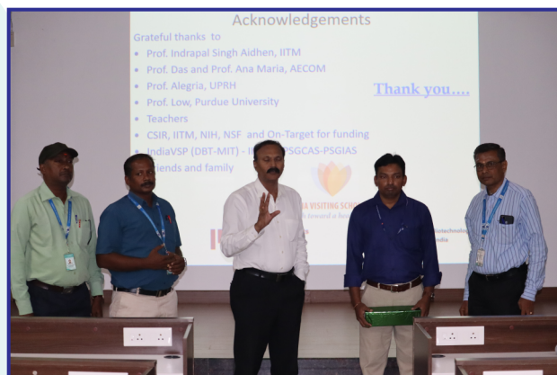
National technology day celebration