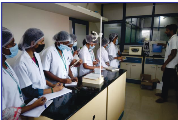
Hands on training - Areete Life sciences, Chennai.