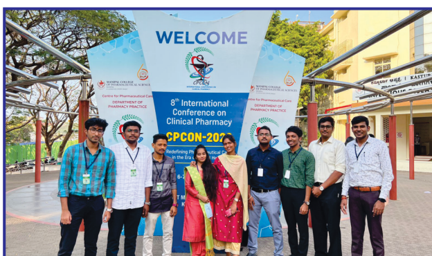
International Conference on Clinical Pharmacy