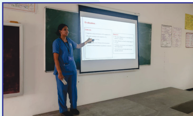
A Seminar on Critical thinking concept