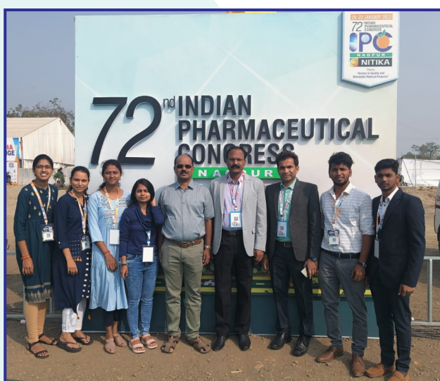
72 nd Indian Pharmaceutical Congress, Nagpur.