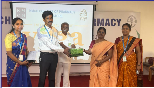
International yoga day celebration