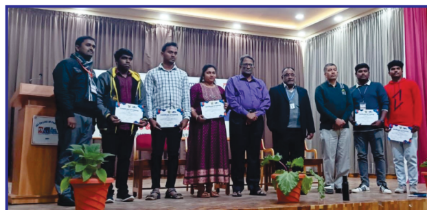
Training Program at JSS Academy of Higher Education

College of pharmacy, Ooty on 10 th and 11 th February 2023.