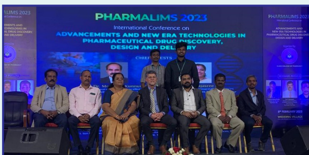
International Conference at Elims College of Pharmacy