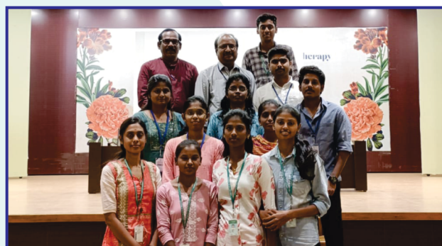
National conference at PSG College of Pharmacy.