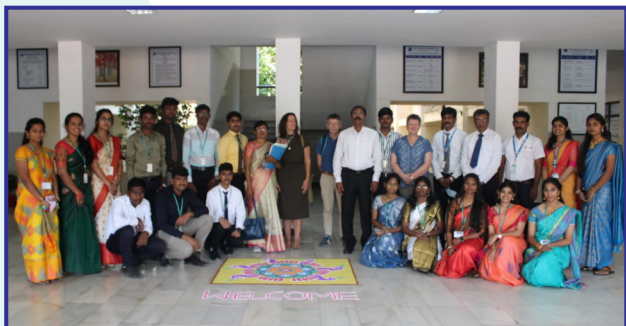
One day International level Seminar

46. Science day celebration was organized on 28 th February 2023, in our college campus for the remembrance of Sir C.V. Raman, who was awarded the Nobel Prize in Physics on 1930 for his discovery of the Raman effect.