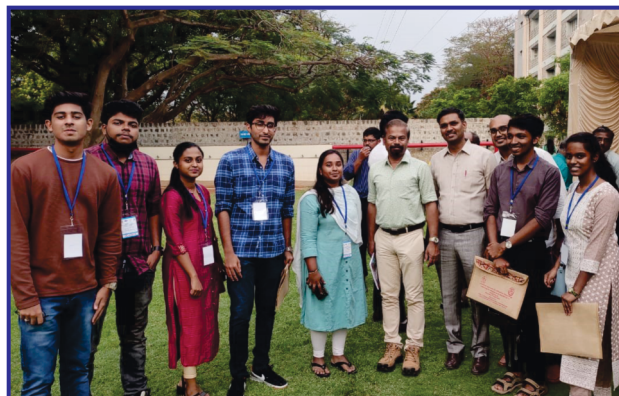
Seminar on Effective Teaching

“Effective Teaching, Learning, Strategies and Research in Pharmacy, organized by PSG College of Pharmacy”, Coimbatore on 01 st April 2023.