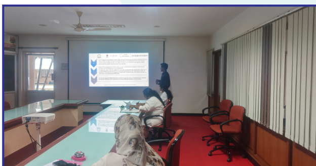
Conference on Clinical Practice