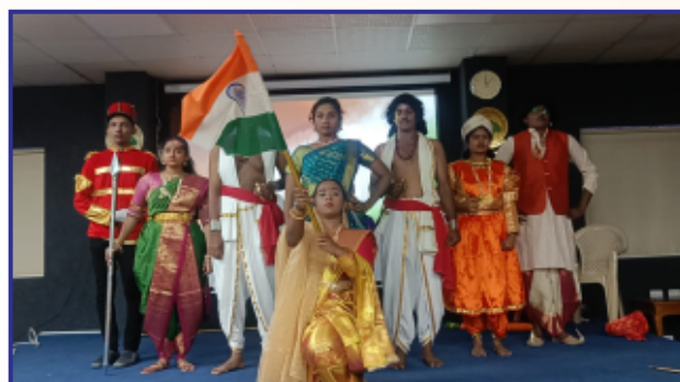
Students participated in Zonal level group skit competition, Azadi Ka Amrit Mahotsav Independence Day Celebrations – 2022