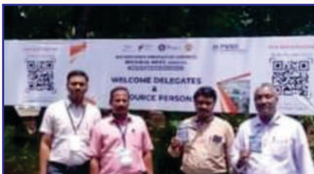
Staff participated in Institutions Innovation Council at PSNA College of Engineering and Technology, Madurai.