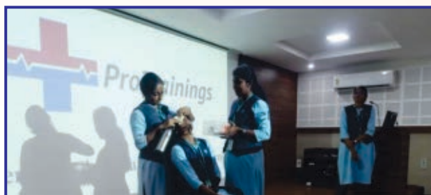
World First Aid Day Celebration, Pharm.D students sharing the importance of first aid.

51. World first aid day was also organized by Institution innovation council of our college, Our Pharm.D students participated in that event to evoke the importance of first aid among the students on 14 th September, 2022.