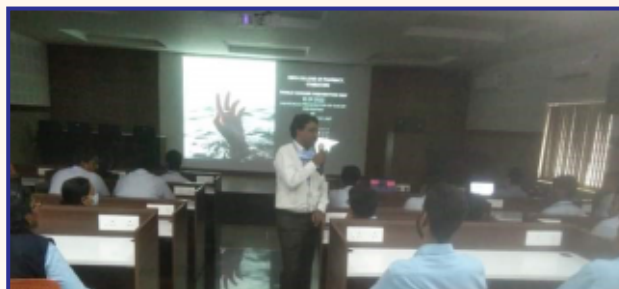
Students awareness programme about suicide on World Suicide Prevention Day

50. World suicide prevention day was organized by institution innovation council of our college to create awareness about suicide among the students on 10 th September, 2022.