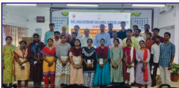
Staff and M.Pharm students, attended a national conference Veterinary College and Research Institute, Namakkal,.