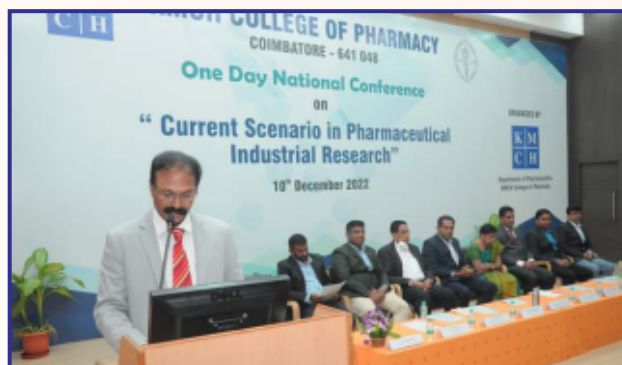
One day National Conference about 'Current Scenario in Pharmaceutical Industrial Research'.

Deputy GM, Bioplus Pvt Ltd, Bengaluru, were the resource persons. E-poster presentation was organised , for students from various colleges all over the India. At the end of scientific session, certificate with cash prizes were distributed to the best three scientific presentations.