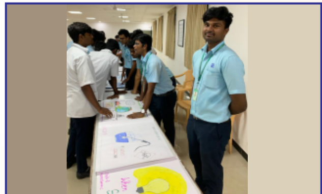
National Energy Conservation Day on 14 th December 2022

55. Poster making competition was conducted on the eve of National Pollution Control day and National Energy Conservation day on 2 nd December, and 14 th December, 2022, respectively.