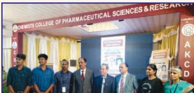
Staff and students attended a National conference at Chemists College of Pharmacy, Kerala.