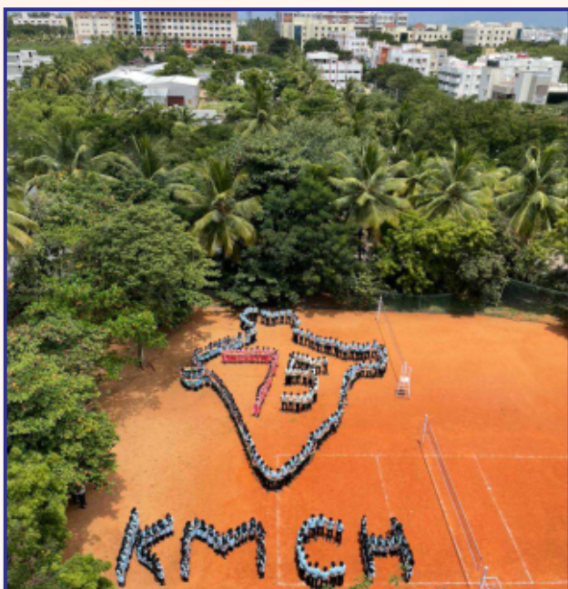
75 th Independence Day Celebration - Azadi Ka Amrit Mahotsav in college.

conducted and the winners were awarded with prizes.