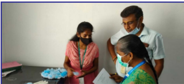
Innovation activities "Gold from Garbage" on National Pharmacovigilance Week Celebration

54. An interactive session was organized by our college regarding "Carrier guidance for international education" by Eazy link academy, to provide guidance regarding the abroad education on 31 st October, 2022.