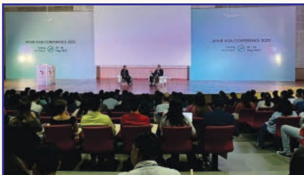
B.Pharm students attended HPAIR Asia Conference 2022 at New Delhi.