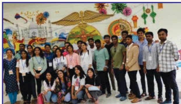
M.Pharm students attended a Preconference Workshop at Manipal College of pharmaceutical sciences, Manipal.