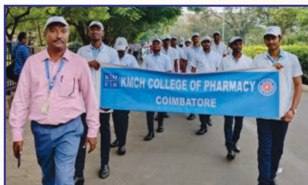
KMCH COP Organized National Pharmacy Week Celebration Rally.

23. 61 st National pharmacy week was celebrated in KMCH college of Pharmacy in Association with IPA Coimbatore local branch. based on the theme “Pharmacy of the World–India” from 21 st November to 26 th November, 2022, Elocution, Debate, Poster making, Clip art, and quiz competition were conducted.