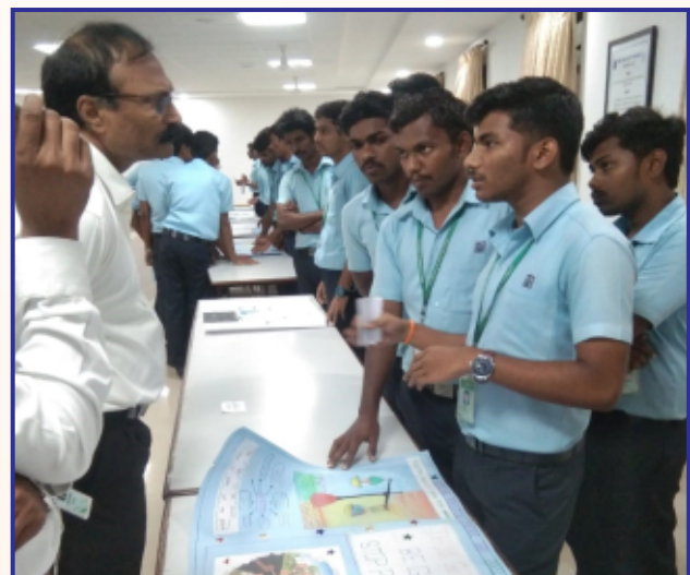
National Pollution Control Day Celebrated on 2 nd December, 2022.