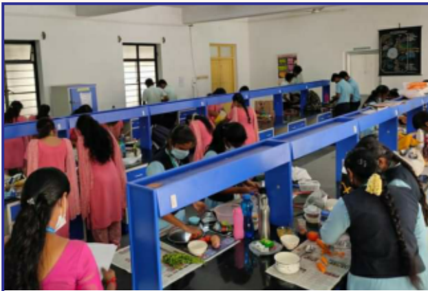
National Pharmacy week Celebration Cooking without Fire

53. National Pharmacy week was celebrated on 24 th September, 2022, to honour pharmacists all around the world for their crucial role in improving everyone's health, events like cooking without fire, gold from cabbage, quiz, E-poster presentation were conducted and the prizes were distributed to winners of the respective event on the same day. This year theme aims to promote unity and highlight the side effects of pharmacy on health and to showcase pharmacy's positive impact on health around the world and to further strengthen solidarity among the profession.