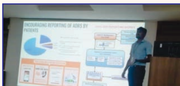
E-poster presentation on National Pharmacovigilance Week Celebration

52. National Pharmacovigilance week celebration was organized about the Theme "Encouraging reporting of ADR by patients", various events like oral presentation, poster presentation, Quiz, Essay writing, Short flim making, was conducted from 19 th to 23 rd September, 2022, and the prizes were distributed to winners of the respective event.