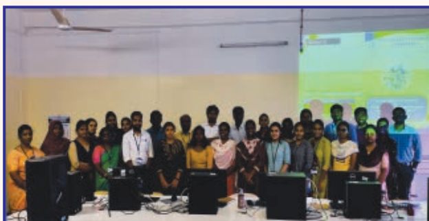
M.Pharm students attended a National conference at PGS College of Pharmacy, Coimbatore.