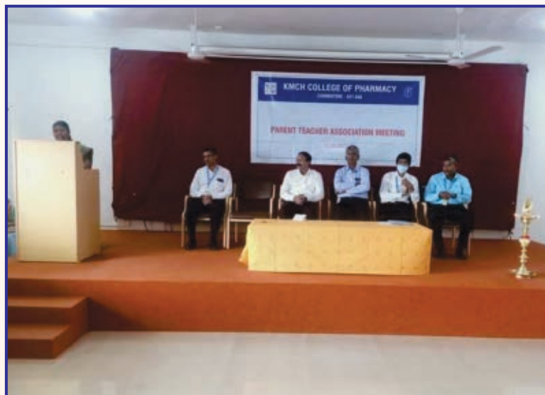
Parents Teacher's Association Meeting

57. KMCHCOP 7 th Parents Teacher's Association (PTA) meeting was held on 21 st November, 2022, The Parents Teacher's Association (PTA) meeting being conducted every year regularly, to inform about the academic activities, dress code, sessional marks, attendance and regarding placement activities.