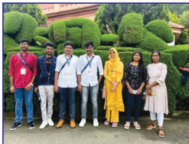
III Year B.Pharm students attended a National symposium at JSS college of pharmacy, Ooty.