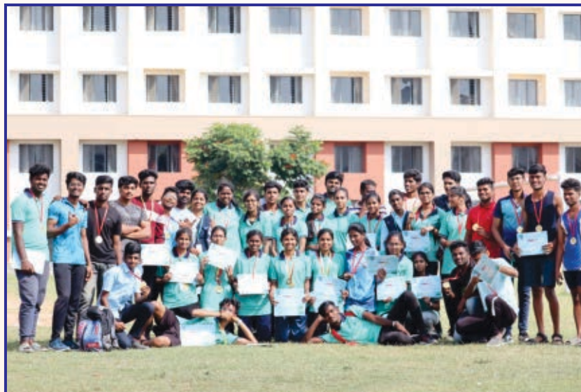
Medifest 2k22 sports at pavai arangam ground.