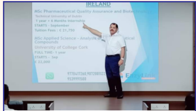
Interactive session regarding "Carrier guidance for international education" by Eazy link academy.

54. An interactive session was organized by our college regarding "Carrier guidance for international education" by Eazy link academy, to provide guidance regarding the abroad education on 31 st October, 2022.