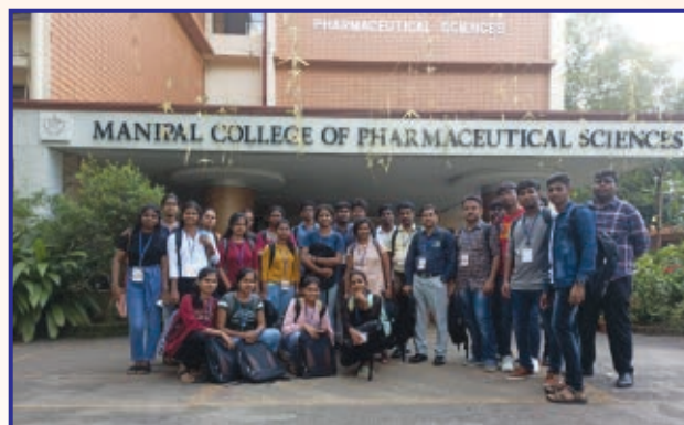
Staff and M.Pharm students attended a Preconference Workshop at Manipal college of pharmaceutical sciences, Manipal.