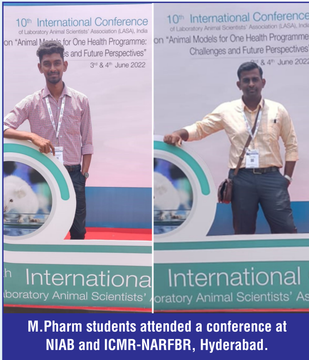
M.Pharm students attended a conference at NIAB and ICMR-NARFBR, Hyderabad.

Second year B.Pharm students attended a conference on “AU PHARMACON-2022 - 6 th National Conference on Trending Research and Innovations in Pharmaceutical Sciences” at School of Pharmacy, Anurag University, Hyderabad, on 22 nd and 23 rd July, 2022.