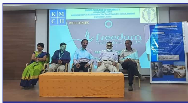
Placement recruitment by freedom ophthalmic pvt ltd.

Placement cell of KMCH College of Pharmacy organized campus drive for our students on 15 th March 2022 and 22 nd April 2022 where M/s Maiva Pharm, Hosur, and Freedom Ophthalmic private limited, Bangalore conducted interview respectively.