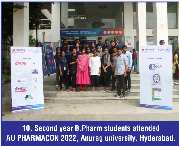
10. Second year B.Pharm students attended AU PHARMACON 2022, Anurag university, Hyderabad.

Second year B.Pharm students attended a conference on “AU PHARMACON-2022 - 6 th National Conference on Trending Research and Innovations in Pharmaceutical Sciences” at School of Pharmacy, Anurag University, Hyderabad, on 22 nd and 23 rd July, 2022.