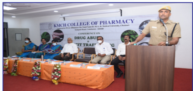
Mr.Silambarasan Deputy Commissioner of Police deliver lecture on Drug Abuse and illicit trafficking

A Conference on “Drug Abuse and illicit trafficking” was organised on 4 th July, 2022, where Mr.Silambarasan., Deputy Commissioner of Police, Coimbatore., deliver the cheif guest address.