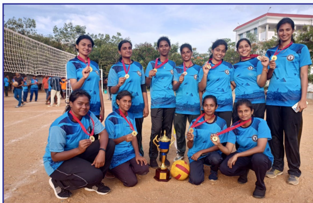
KMCH COP Throw ball team had won the first place in State Level Pharma Trophy 2022.