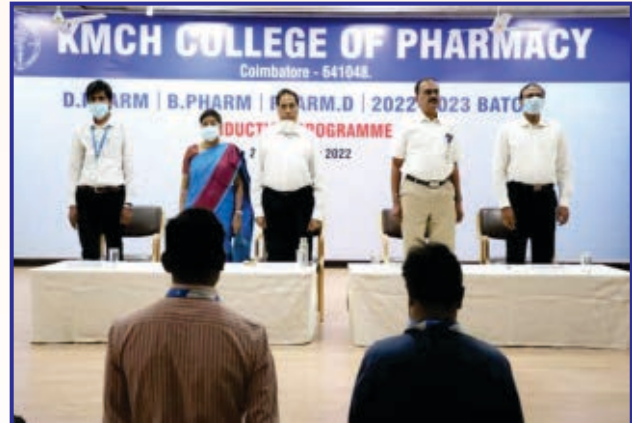
The induction programme for 2022-2023 batch held on 21 st Nov 2022