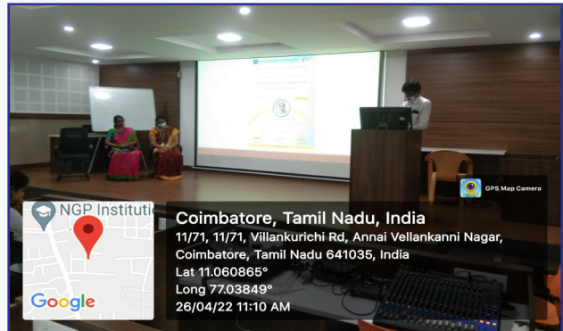
Coimbatore, Tamil Nadu, India 11/71, 11/71, Villankurichi Rd, Annai Vellankanni Nagar, Coimbatore, Tamil Nadu 641035, India Lat 11.060865° Long 77.03849° 26/04/22 11:10 AM